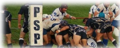
Try line action in the home match against Kingsbridge

Saturday 7th December 2013 St Ives v Paignton Saxons